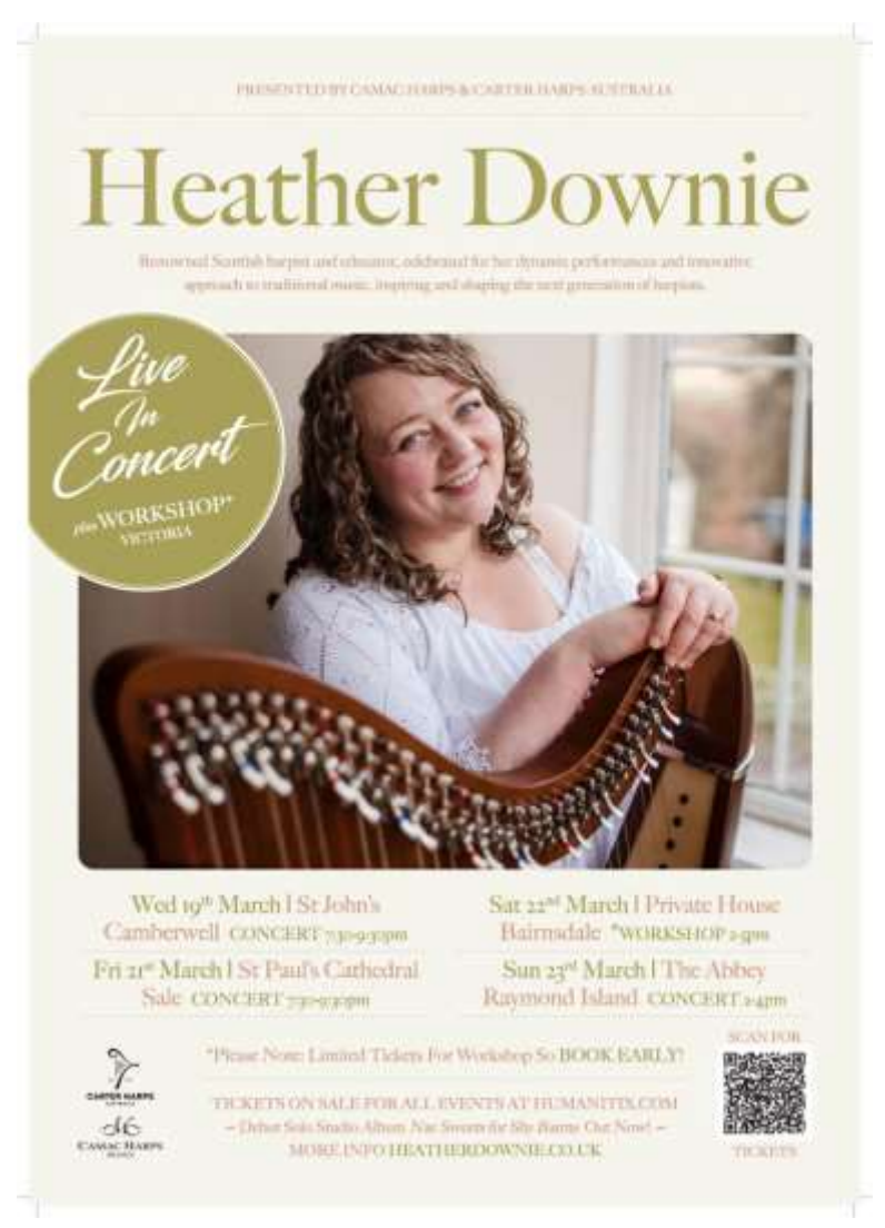
Tickets $30, and can be paid for at the door. 21st March 7.30pm